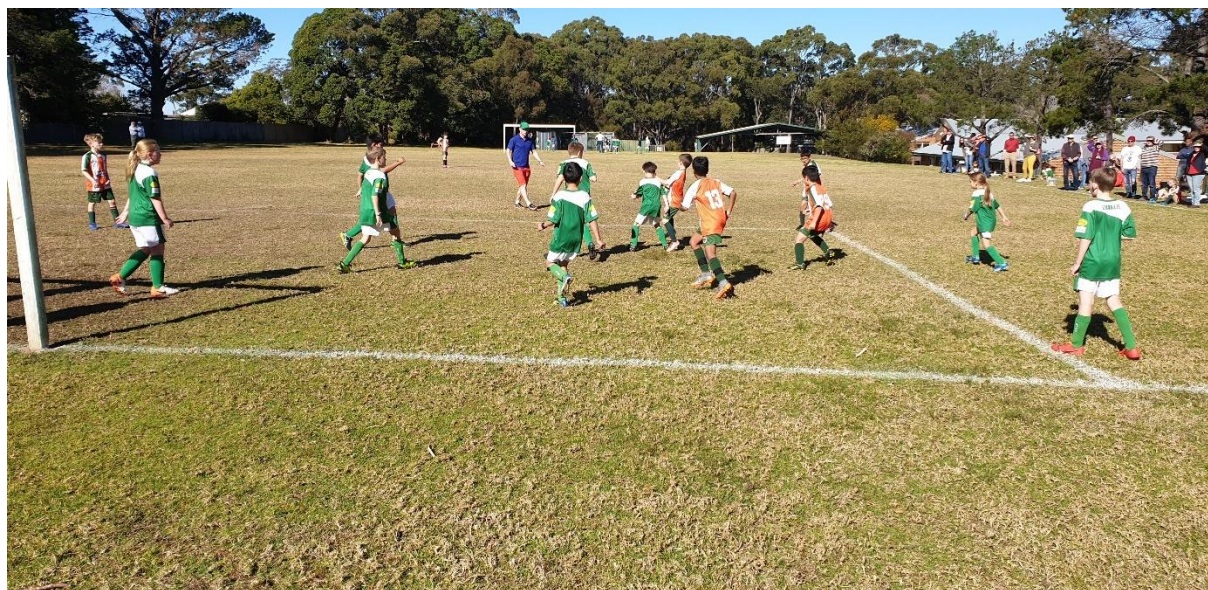
Games at St Ives Park primary