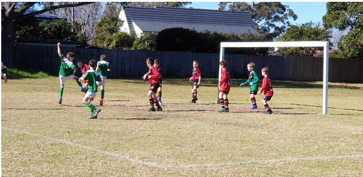
Games at St Ives Park primary