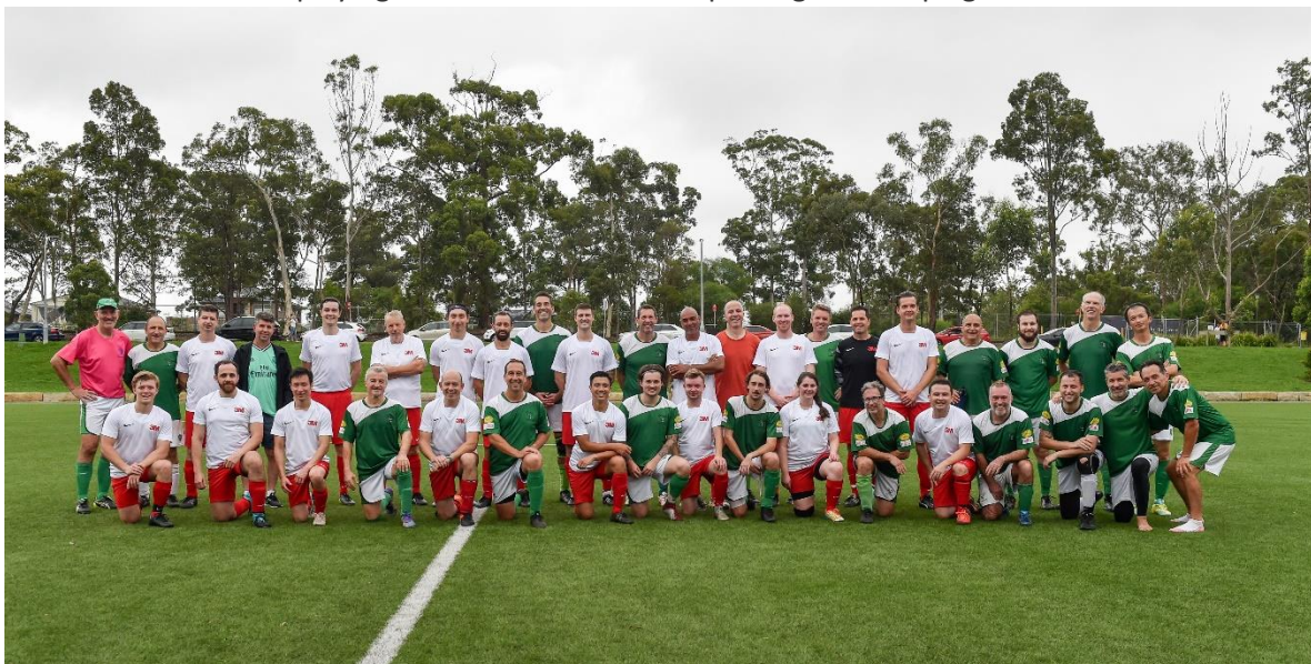
Players from the 2021 St Ives v 3M game

With the funds raised we purchased more defibrillator units and have distributed two to other NSFA clubs (Lane Cove west and Greenwich football Clubs) to make sure that they have coverage when their teams are playing. Below Damian is Championing the campaign to raise funds.